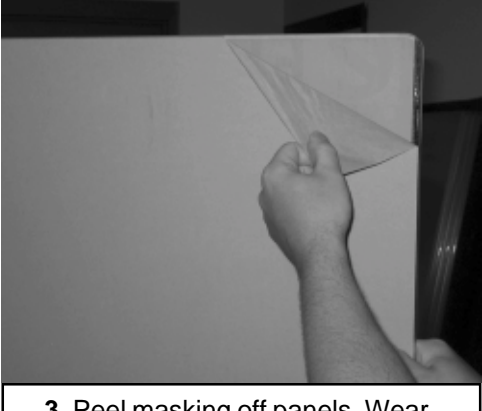
3. Peel masking off panels. Wear gloves when handling acrylic to avoid fingerprints.

4. Install H-channels on top of main shields. Outside edge of H-channel should line up with outside edge of shield below.