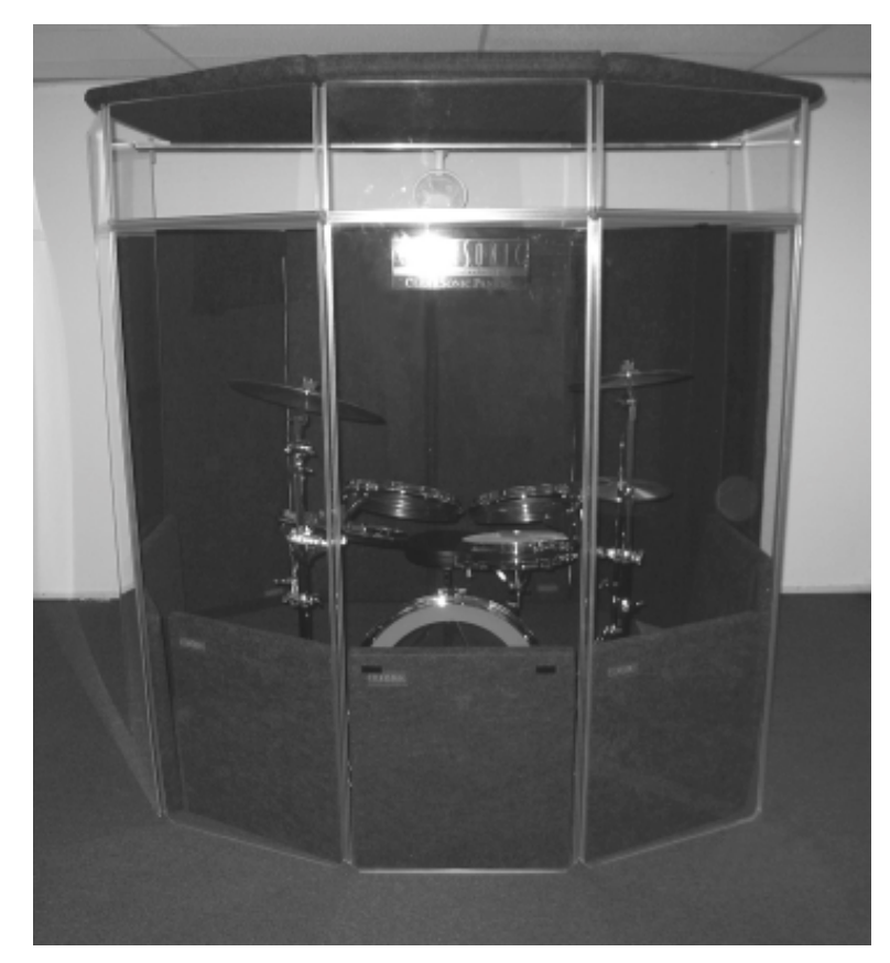
Your IsoPac is now complete!

Please contact us should you have any questions or concerns about IsoPac assembly or operation. Thank you for using ClearSonic products. 800.888.6360 / info@clearsonic.com