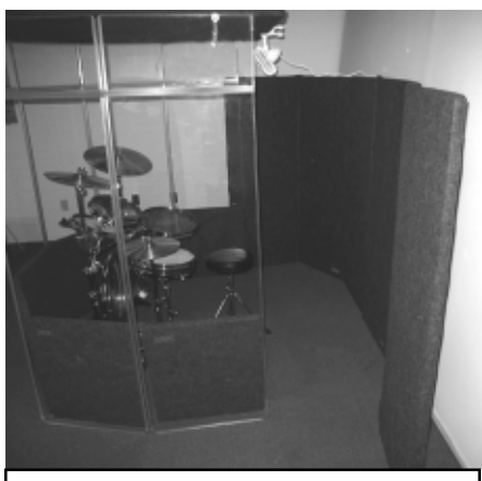
18. Use end S5-2 baffle as door to enter IsoPac.

17. Leave a small opening in upper back of IsoPac to allow for some air exchange. If necessary, overlap S5-2 and end shields to decrease opening.