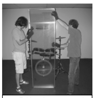
7. Fold up the system and "walk" them to the front center of kit or whatever you're isolating.

6. Note hinge configuration of large shield system. Be sure AX will be able to fold 180 degrees in same direction as the base system once installed. Use your ladder if needed and have your assistant "feed" the folded AX panels one at a time while you place them into position atop the larger shields. Make sure edges line up. Don't seat AX panels completely until all are in place. Tap top of AX panels with rubber mallet to seat completely into H-channel.